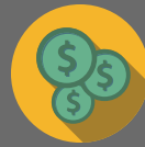
VAS - Payment Types & Acceptance Methods