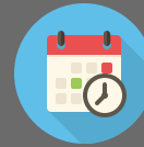
VAS - Back Office Tools