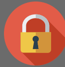
VAS - Security & Fraud Detection